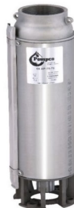
EXAMPLE OF MODEL NUMBER